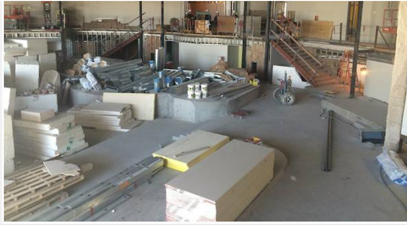
Draï's Nightclub, under construction

The 25,000-square-foot, two-story rooftop venue that is Draï's Nightclub will look out onto Draï's Beach Club. The official specs of the nightclub list a capacity of 2,200 people with six dedicated elevators, two VIP bathrooms (say what?), a Funktion One sound system and provocative interiors decorated in deep purple and gold. The club is also wrapped in about 2,000 square feet of LED screens. (Another 2,000 square feet surround the beach club outside.)